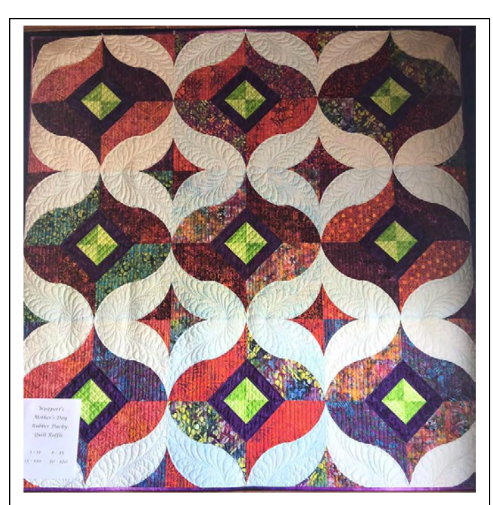
YOU CAN WIN this hand-made Quilt and much more at the Ducky Races Raffle on May 14<sup>th</sup>!