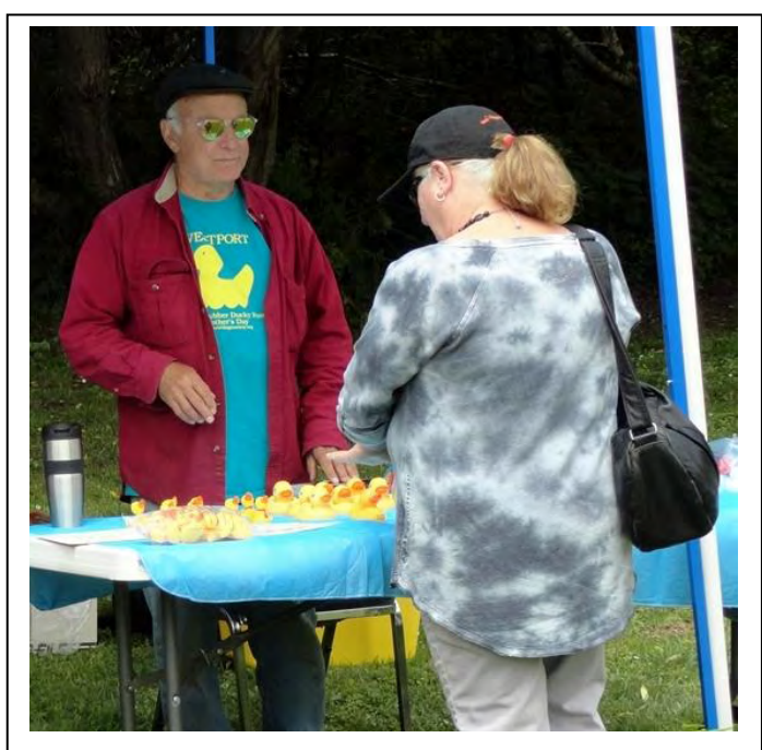
Don't own your own racing duck? No problem – you can buy one (or more) at The Ducky Races!

Our Rubber Ducky Races help fund the Westport Village Society, a nonprofit organization dedicated to land conservation, coastal access, and other projects that benefit the Westport community. The spark prompting its formation was a development project