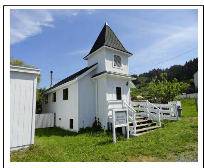
The Westport Community Church