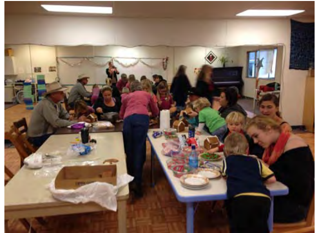
Ginger Bread House workshop 12/20/2014 THANK YOU QUEENIE!!