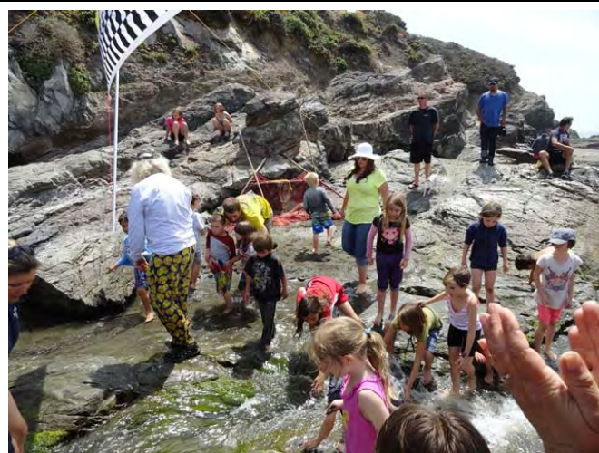
The Mighty Ducklings retrieving the ducks after they cross the finish line