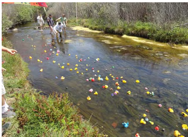
AND THEY'RE OFF!