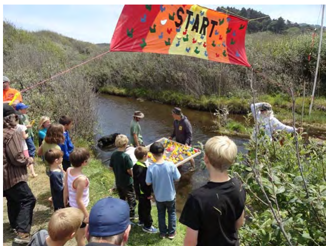
The Kids' Race is about to begin!