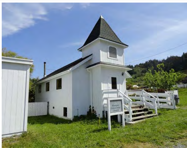
The Westport Community Church