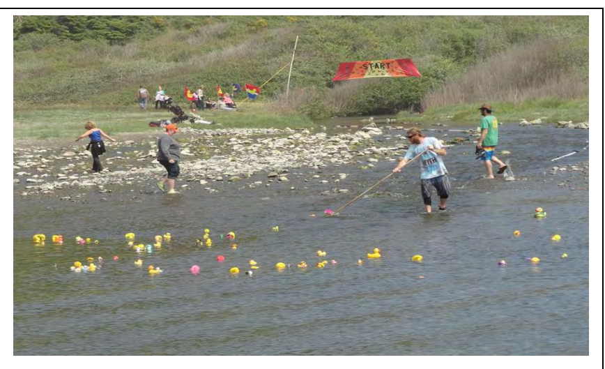
The Ducks Are In The Water in the Classic Ducky Race!

Movie Night resumes this month at the Westport Community Recreation Center with The Peanuts Movie . Doors open at 6:00PM on Saturday, June 18<sup>th</sup>, with the movie starting when the popcorn is ready (usually around 6:20PM). Bring pillows and blankets for the kids (jammies OK) and a comfy chair for yourself if you want one. You don't have to have children to come enjoy the movie – everyone is welcome!