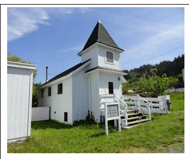
The Westport Community Church