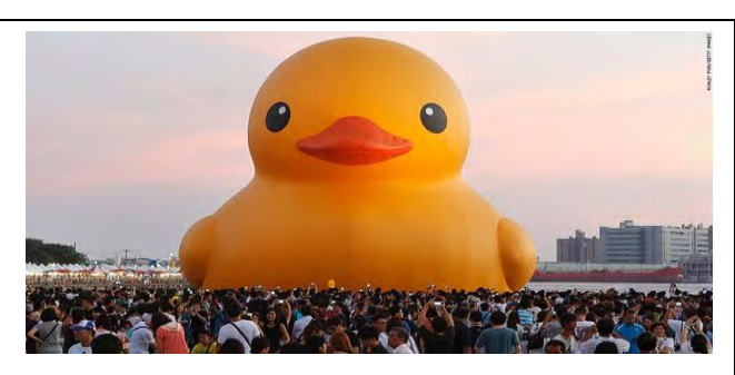
May The Duck Be With You!