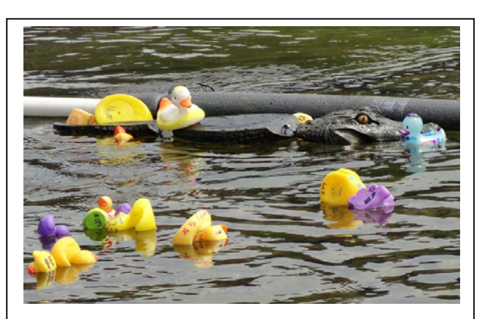
HEY, THAT'S NOT A DUCK!