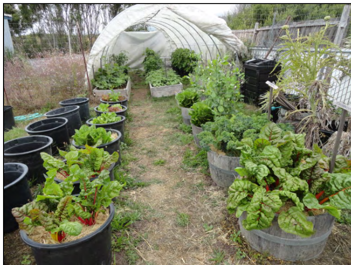
Free vegetables for all at the Community Garden!

This month's feature will be A Bug's Life . Doors will open at 6:00PM on Saturday, August 22 nd , with the movie starting when the popcorn is ready (usually by 6:20). Bring pillows and blankets/sleeping bags for the kids and a comfy chair for yourself!