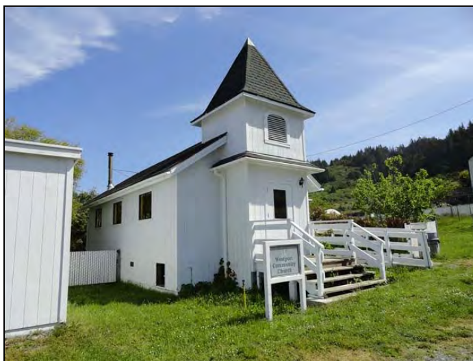
The Westport Community Church