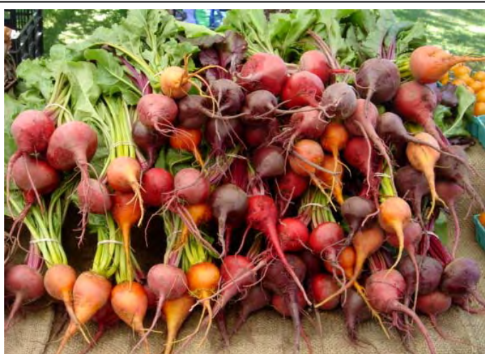
Harvest

There are, of course, many things to renew at this time of year. And one of the most important things to renew is your membership in the Westport Village Society! For 20 years now, the non-profit WVS has been our community vehicle for the preservation, enhancement, and interpretation of the natural environment in and around Westport. Everything we do is done by volunteers and supported by your dues and donations, including publishing this monthly newsletter. So please take a minute to renew or begin your WVS membership by filling out the form on page 6 and mailing it with your donation to P.O. Box 446, Westport, CA 95488. Thank you so much – we can see those halos over your heads already!